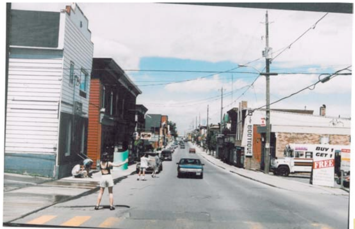
Main Street, Looking North. Years Later