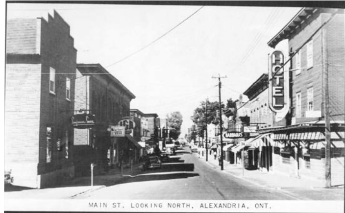
Main Street, Looking North