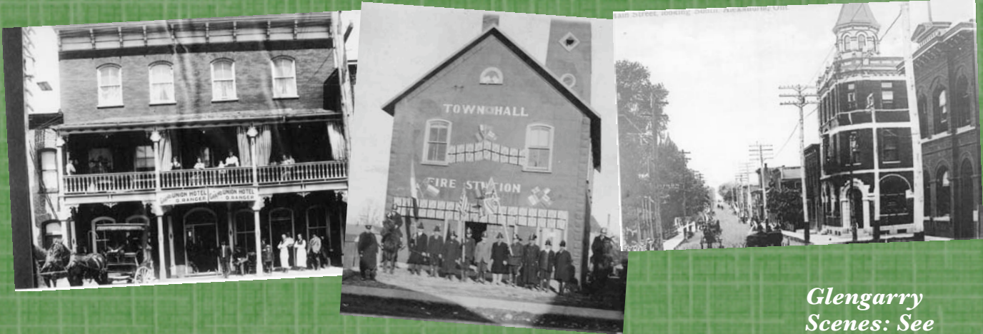
Glengarry Scenes: See Page 4